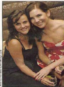
Pic's Gia Carides and June Diane Raphael at the Empire Hotel party; right: Amber Tamblyn and David Cross